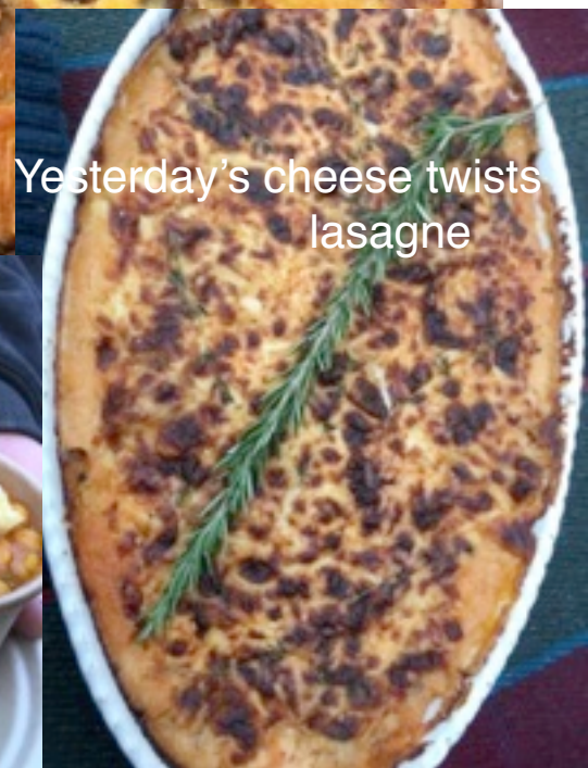
Yesterday's cheese twists lasagne