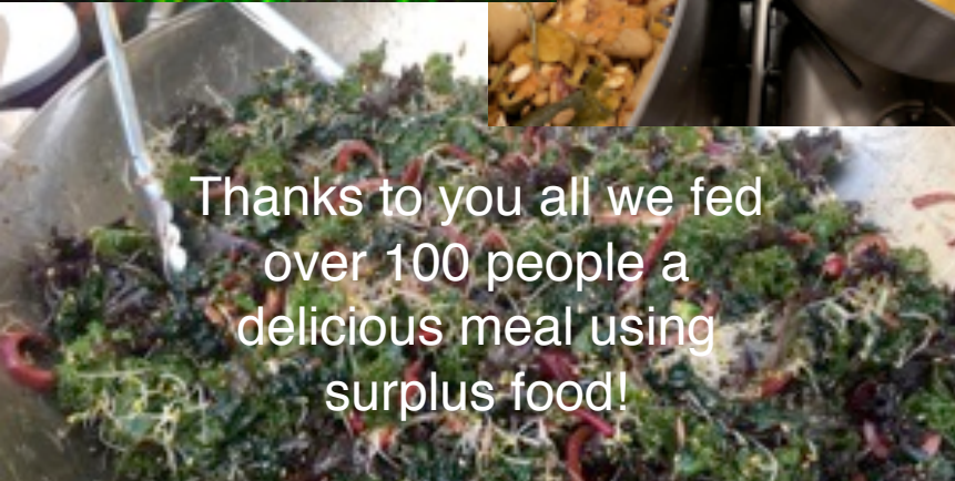
Thanks to you all we fed over 100 people a delicious meal using surplus food!