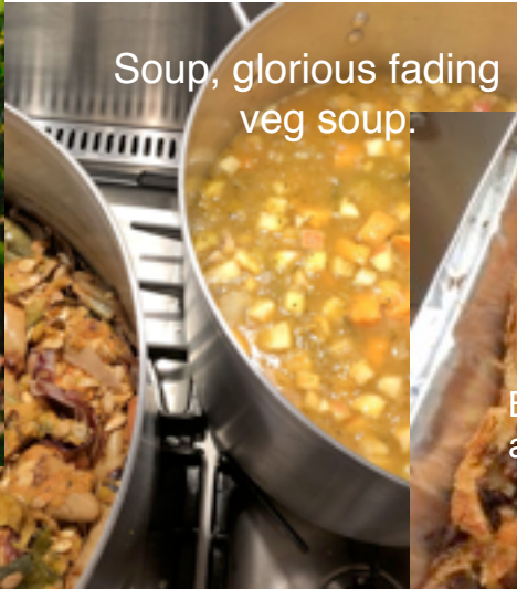
Soup, glorious fading veg soup.