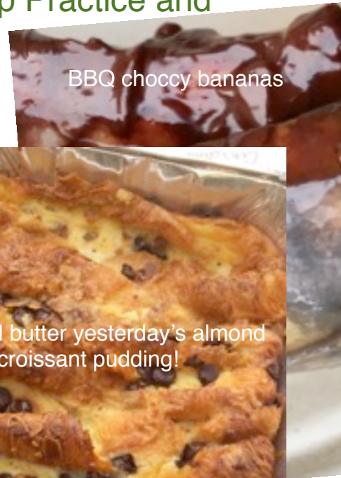
BBQ choccoy bananas