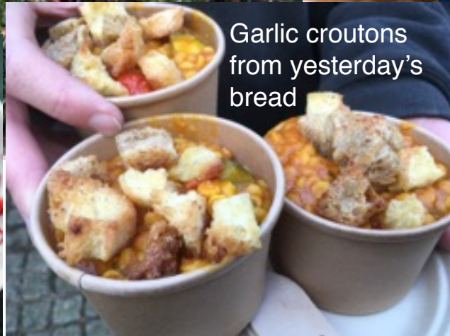
Garlic croutons from yesterday's bread

Did you know that 24 million slices of bread are thrown away in the UK each day and over 5 million potatoes? We would like to meet you all together in January 2018, to talk about how we can co-create a People's Pantry here in Kentish Town. www.thelisteningspace.uk/ Debbie Bourne 07910124359